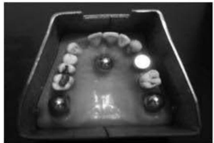
Figure 1. Pattern model.

The dimensional changes caused by the two different processes were calculated by Best-Fit method, using 34 fixed points for comparison between models (Fig. 2).