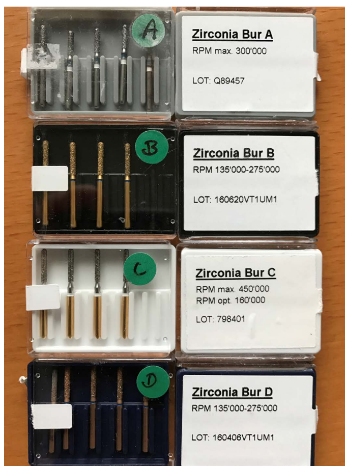
Figure 1. An example of the 4 used burs for the evaluation.

Advice was given to cut 1 mm deep grooves into the zirconia using the side of